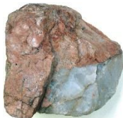
obsidian granite basalt

Far underground, the temperature is so hot, rock melts into a liquid (molten rock). When the liquid is underground it is called 'magma' and it can cool to form an intrusive rock. When it spills out (volcano), the liquid is called 'lava' and it cools to form extrusive rock.