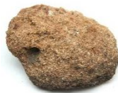
limestone chalk sandstone

These rocks form under the sea. Rocks are broken into small pieces by wind/water (erosion). They settle as mud, sand, minerals and even remains of living things. Over time, layers pile up and the pressure turns this sediment into rock.